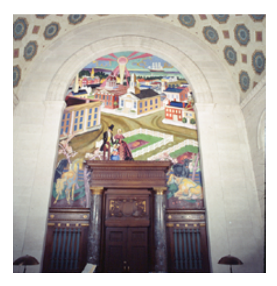
1.The City in 1833 is by

Find out the names of two of the artists who painted the murals on the walls. Two have similar colors and were painted about 50 years apart.