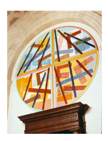
2. Sommer's Sun is by